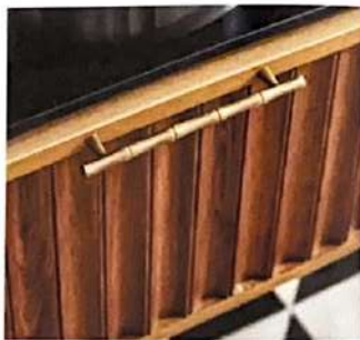
TOP The maroon wall tiles and black and white floor tiles give the guest bathroom a dynamic look.

She says, "As a designer, you always do people's homes, and they get to enjoy it. So now I get to enjoy the little details I put into the house. Living in a space that encapsulates me as a designer and a person, and being able to extend that to my day-to-day life, is very rewarding." ■