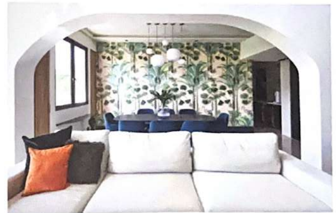
OPPOSITE The dining area is a vibrant space that enjoys natural light.