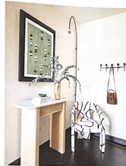
LEFT The foyer is kept understated and functional with a slim console, an armchair, and a spot for holding daily must-haves.

When she saw the print from Milton & King, she knew that was the one. Reflecting that the tropical wallpaper speaks of Singapore, she shares, "I wanted something