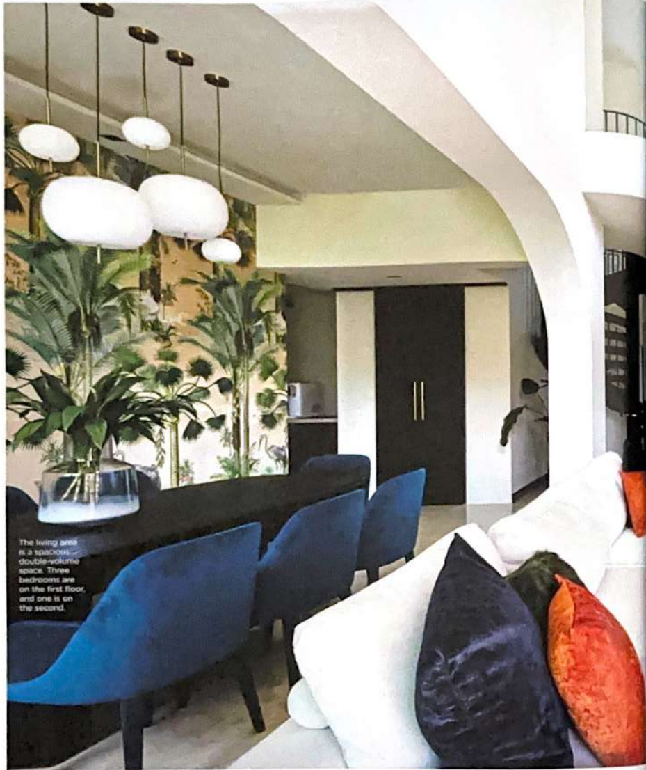
The living area is a spacious, double-volume space. Three bedrooms are on the first floor, and one is on the second.