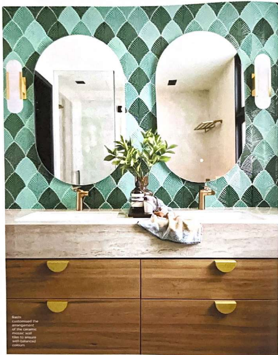
Rashi customised the arrangement of the ceramic mosaic wall tiles to ensure well-balanced colours.