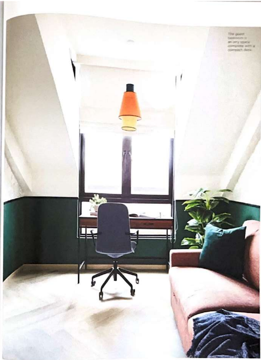
The guest bedroom is an airy space complete with a compact desk.